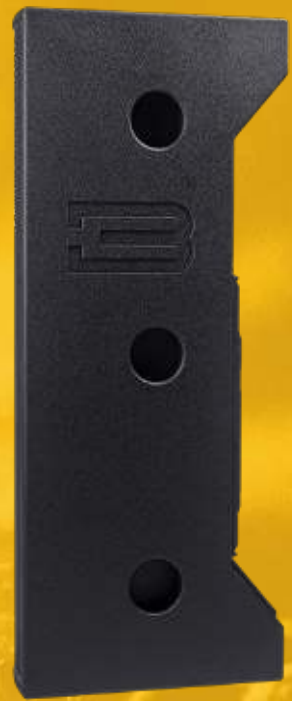
Single Cabinet Response