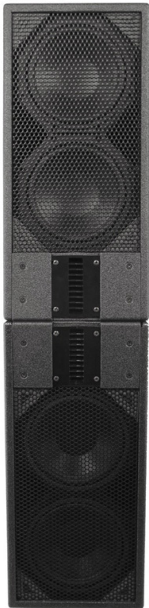
With optional Stacking Bracket