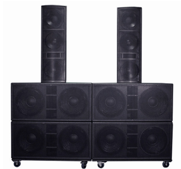
Four SSP218 Subs with two AT312 tops on custom-fit wheel carts.